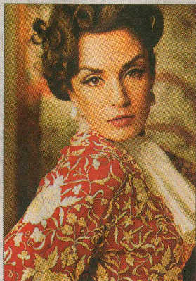
Patine Heritage collection

■ Designer Shon Randhawa will show her Patine Heritage collection at a trunk show at S Studio, Warden Road from November 5-12. The ready-to-wear collection makes use of artisanal Indian embroidery techniques with a contemporary approach.