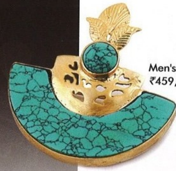
Men's brooch, ₹459, Vollya.com