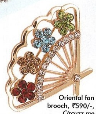
Oriental fan brooch, ₹590/-, Circuzz.me