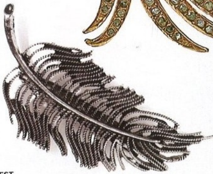
Parfois silver toned brooch, ₹553/-, Myntra LookGood Advisor