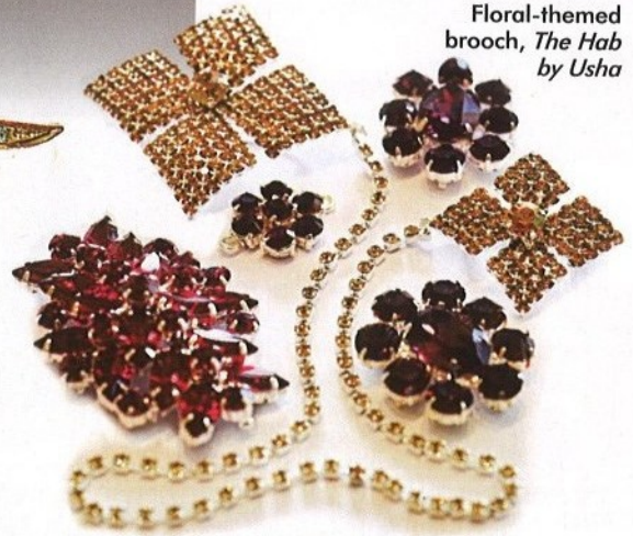
Floral-themed brooch, The Hab by Usha

OTHER PRICES ON REQUEST FOR DETAILS, SEE SHOPPING GUIDE