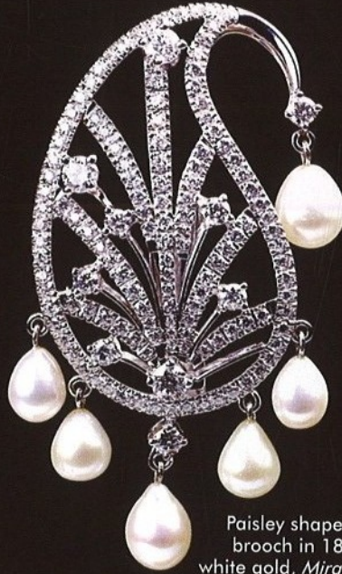
Paisley shaped brooch in 18k white gold, Mirari

BROOCHES HAVE MADE A COMEBACK AND HOW. HERE'S THE MOST EXCITING COLLECTION OF THIS DELICATE PIECE OF SHOULDER JEWELLERY TO ADD AN EXTRA OOMPH TO YOUR STYLE.